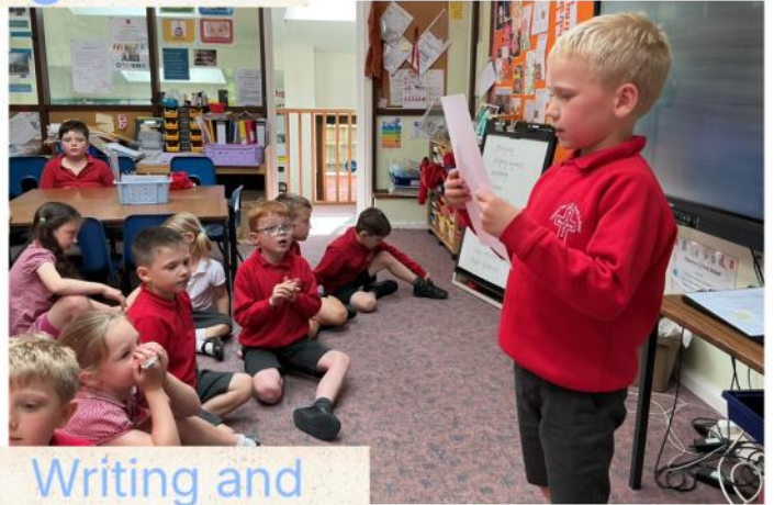
Writing and reading our diamanté poems