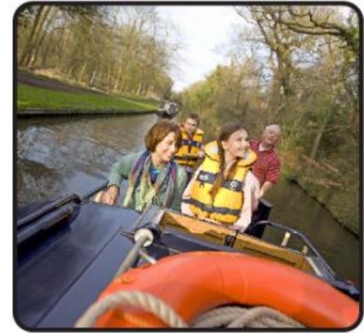
Locks are the way boats get up and down hill.