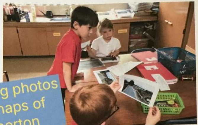
Exploring photos and maps of Tibberton