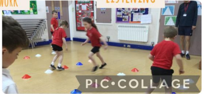
PIC • COLLAGE