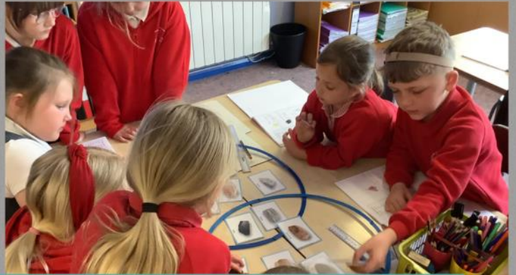
Grouping, sorting and testing rocks.