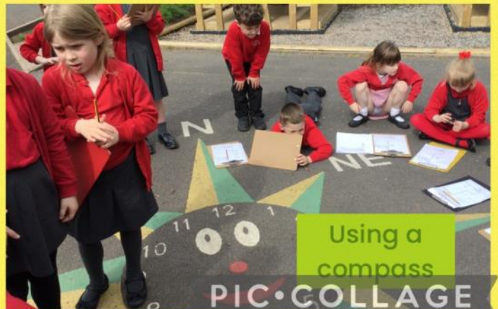
Using a compass