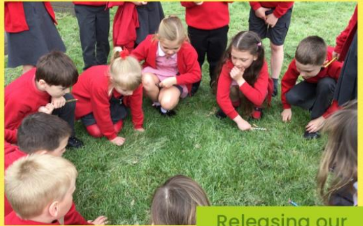
Releasing our butterfly