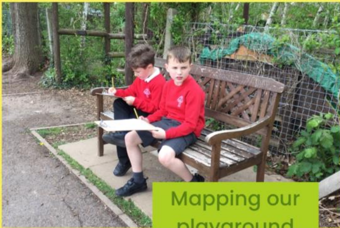
Mapping our playground