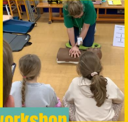
First aid workshop