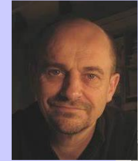
Mick Inkpen 1952 - present