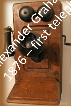
Alexander Graham Bell 1876 – first telephone