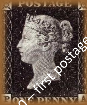
1840 – first postage stamp