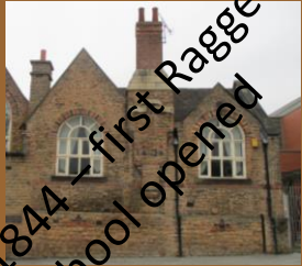
1844 – first Ragged School opened