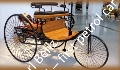
Karl Benz 1885 – first petrol car