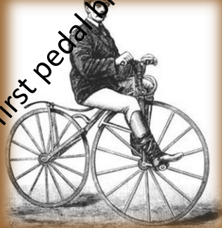
1839 – first pedal bicycle