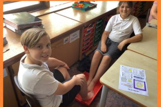
PIC • COLLAGE