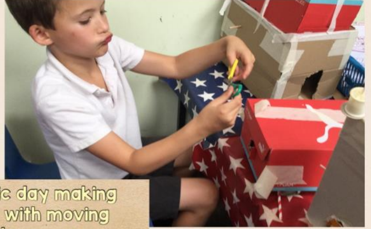
MU had a fantastic day making medieval castles with moving drawbridges.