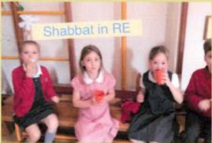
Shabbat in RE