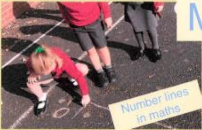
Number lines in maths