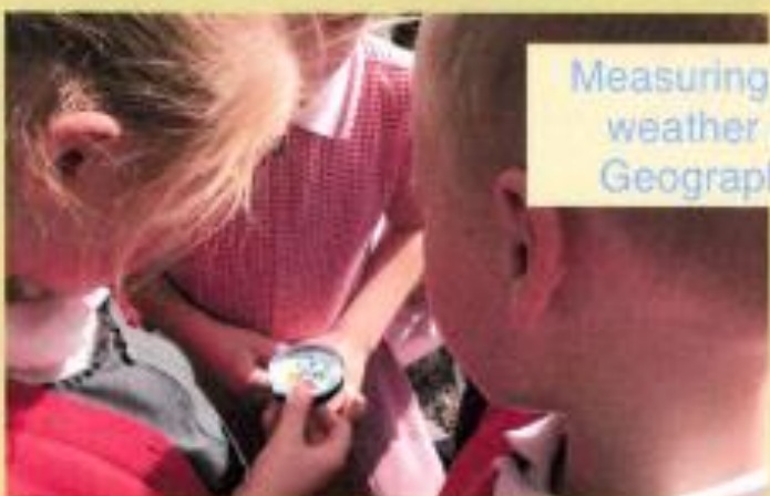
Measuring the weather in Geography