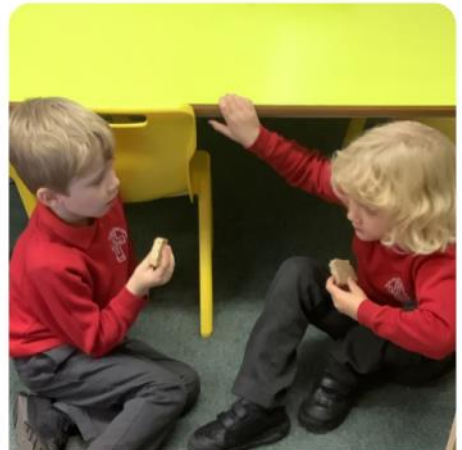
Some of us enjoyed soda bread!