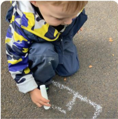
At Woodland Work we practised writing our names.