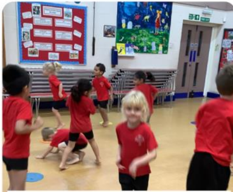
In PE we moved in lots of different ways.