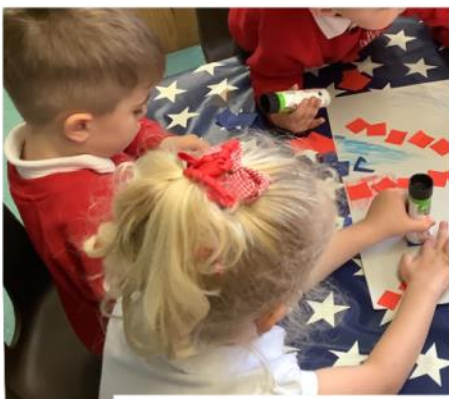
We have also been learning about the different countries in the UK.