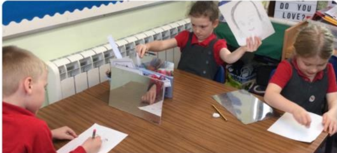
Middle Unit developed their art skills while learning about Sir Roland Hill.