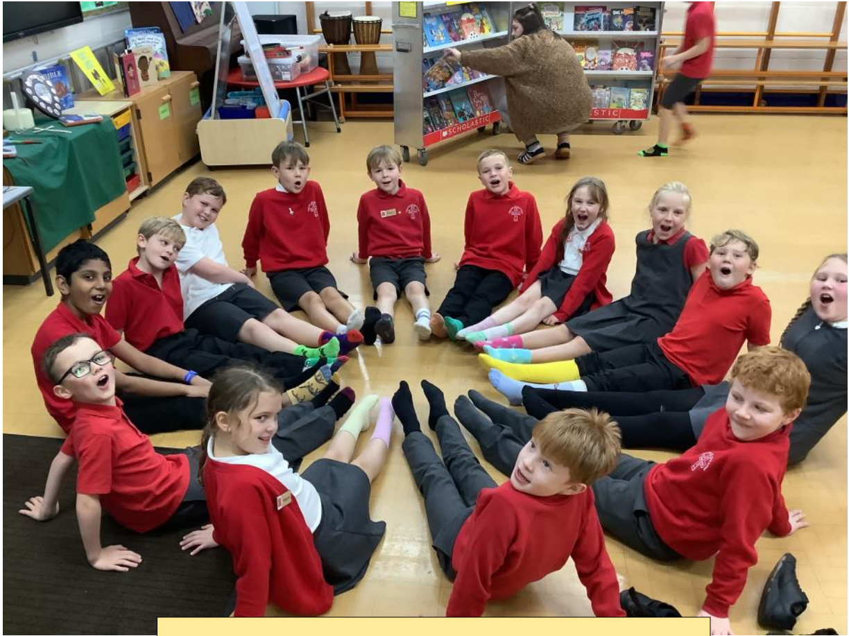
Odd Socks Day 2025!!