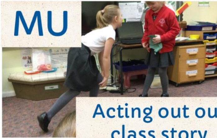
Acting out our class story