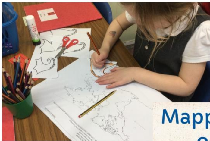
Mapping the 5 oceans