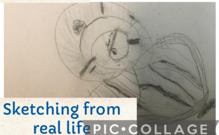
Sketching from real life