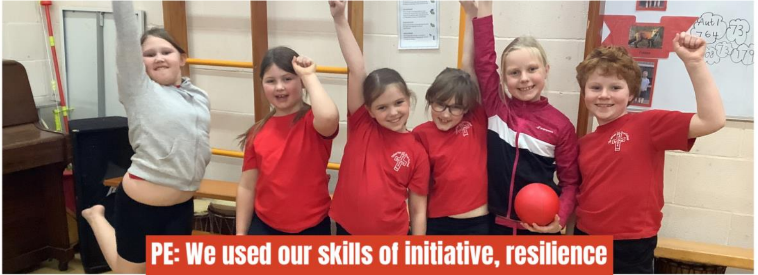
PE: We used our skills of initiative, resilience and teamwork to create games.