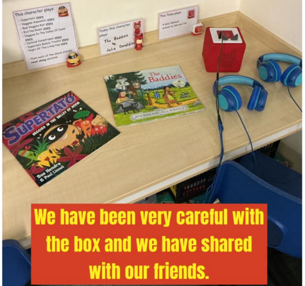
We have been very careful with the box and we have shared with our friends.

We have loved getting to use our new Tonie Box this week.